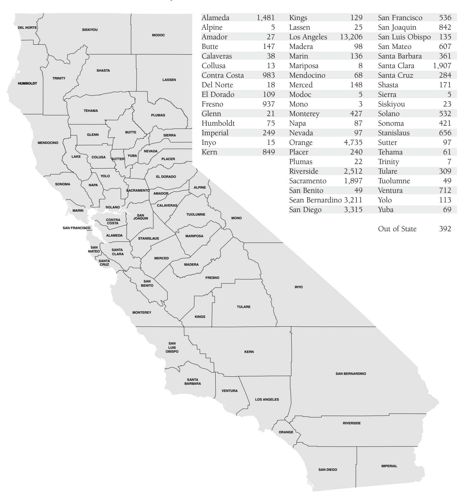
On June 30. 2011, there were 43,674 CRTPs